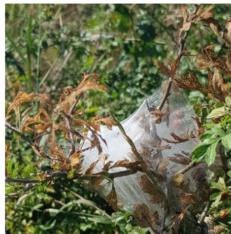
Hedges full of amazing gossamer webs formed to protect the lava of the Hawthorn moth.