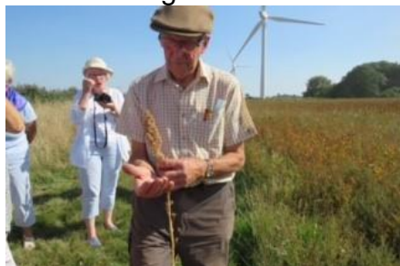
Quinoa growing in Lincolnshire!