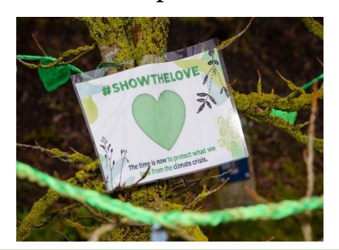
Photos from Crowland, Long Bennington, Wellingore and Witham on the Hill WIs