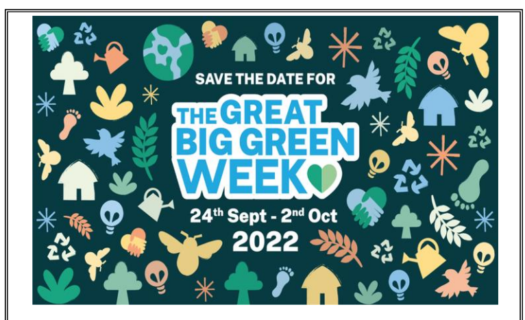
Celebrate the start of Big Green Week with us