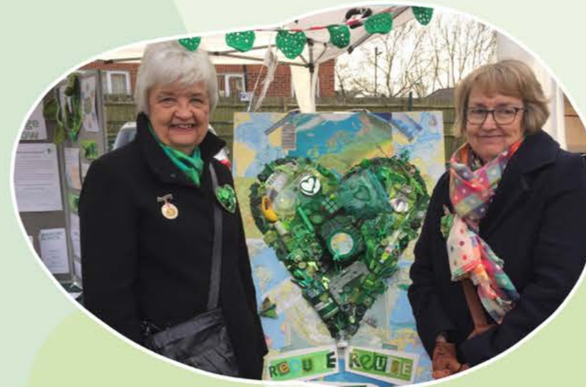
Towcester Evening WI's shared their upcycled green heart at their local farmer's market and it became a window display throughout lockdown.

Each year displays pop up across the UK as people show the love. We see events in libraries, places of worship, community centres, shopping centres, sportsgrounds and more! Join us to show the love this year by creating your own green heart displays in your community, and in your window or front garden for Valentine's Day weekend!