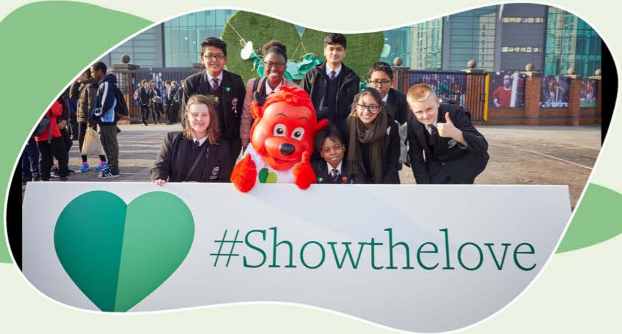
Manchester United Foundation shows the love!

For the past few years, Manchester United Foundation has hosted children from local schools at the Old Trafford Stadium to learn more about protecting what they love from climate change. Could your group connect with a local school to show the love for your local area? Our schools resources are full of ideas and activities for school groups.