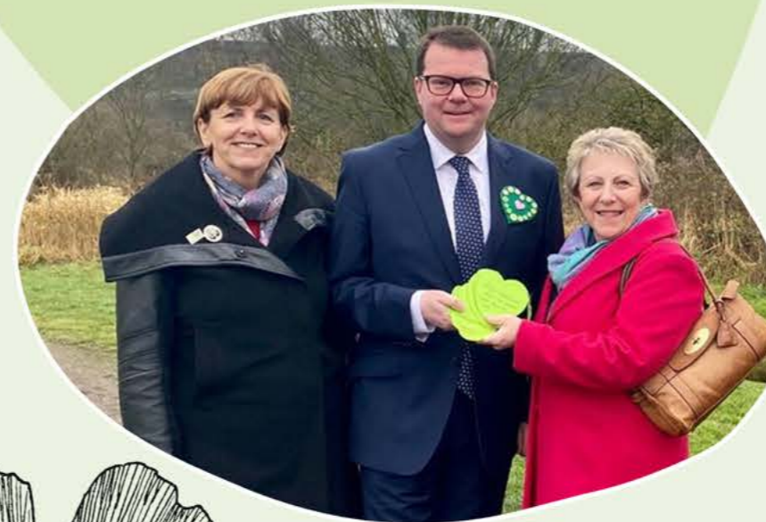
Viaduct Violets WI presented a green heart to their MP, Conor McGinn MP and spoke about the impacts of climate change in Lancashire.