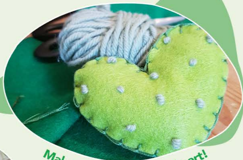
Make and wear a green heart!

These talks are a chance for groups to get together and share their work with other groups, and potentially how your groups could work together to help create a cleaner, greener future. Your talk could be focused on a local or national climate or environmental issues that your group has campaigned on or is concerned about, or a climate craft or skill demonstration.