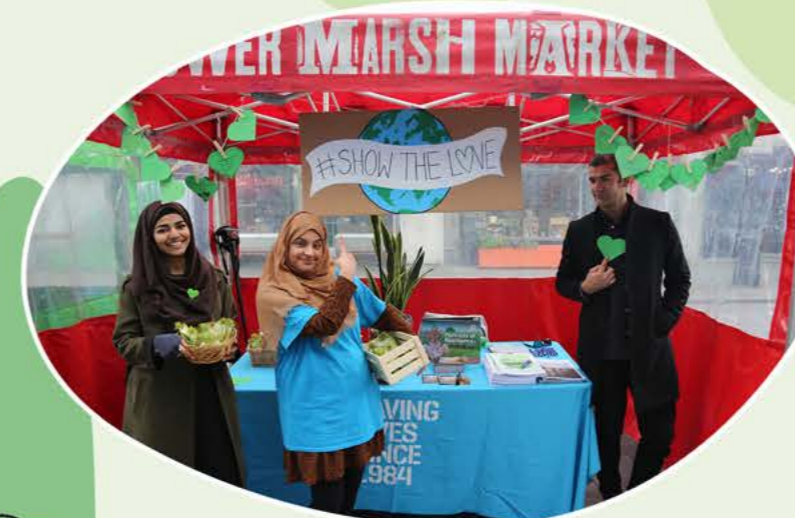
Islamic Relief's Show The Love stall at Lower Marsh market in London.