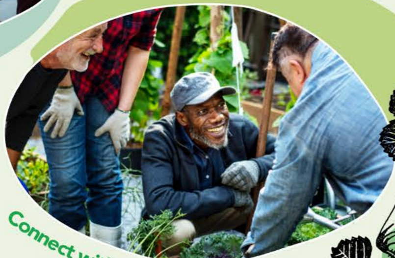
Connect with your community!