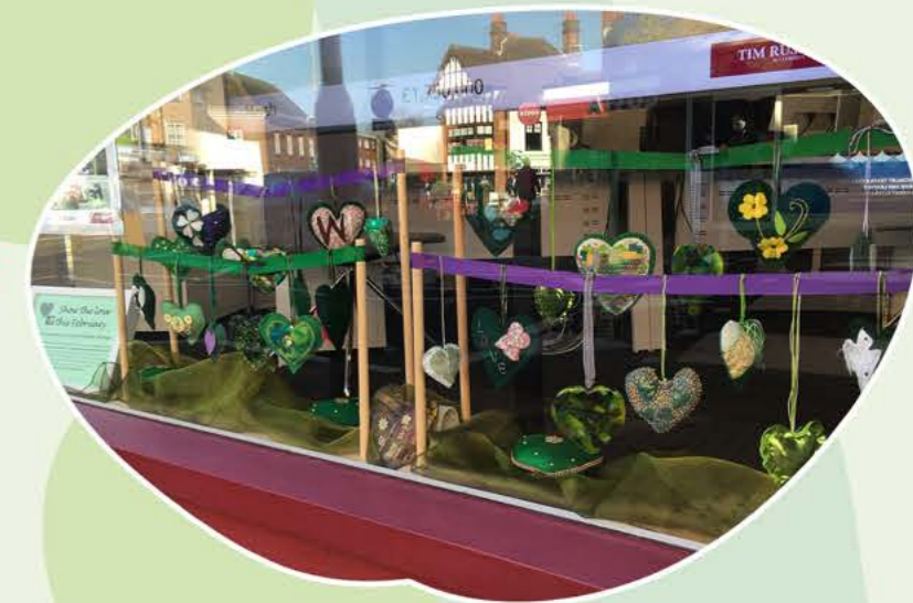
Beaconsfield WI's head-turning display of green hearts in the window of a local estate agent.