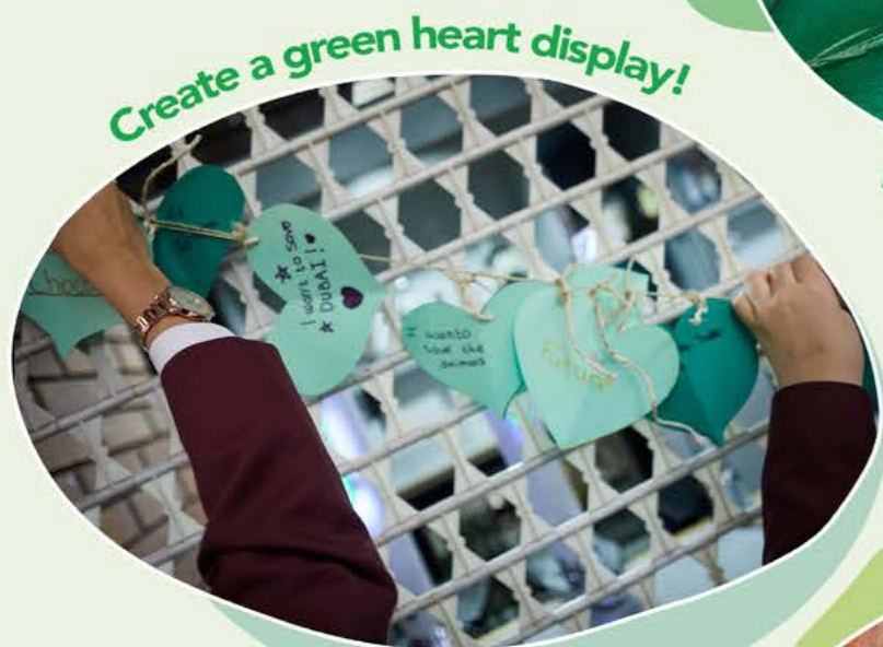
Create a green heart display!