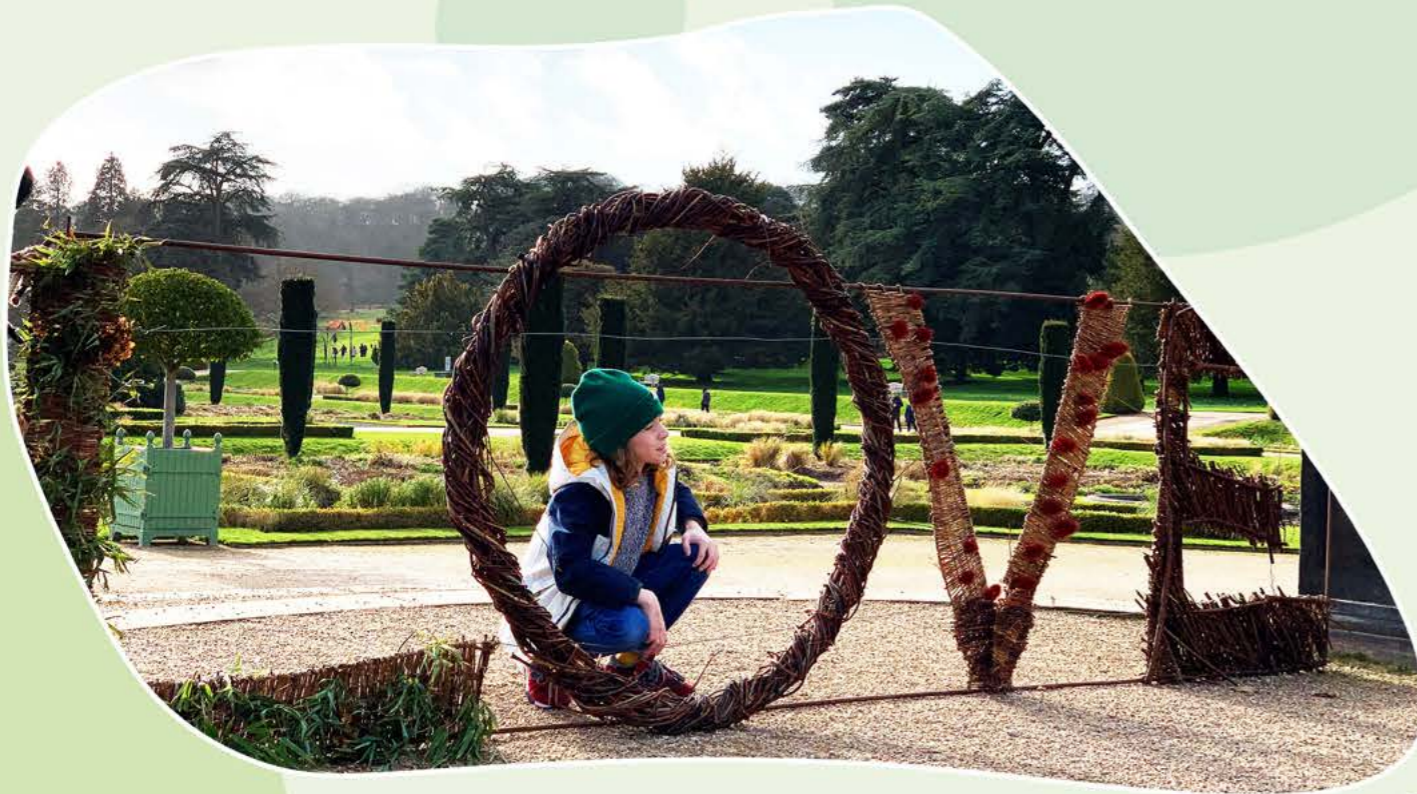
The Trentham Estate's beautiful installation encouraged climate conversations.

To mark Show the Love 2021, perhaps you could turn your garden into a wildlife and wildflower haven and help protect our precious pollinators! You can find tips on how to do this at theclimatcoalition.org/wildlife-gardening